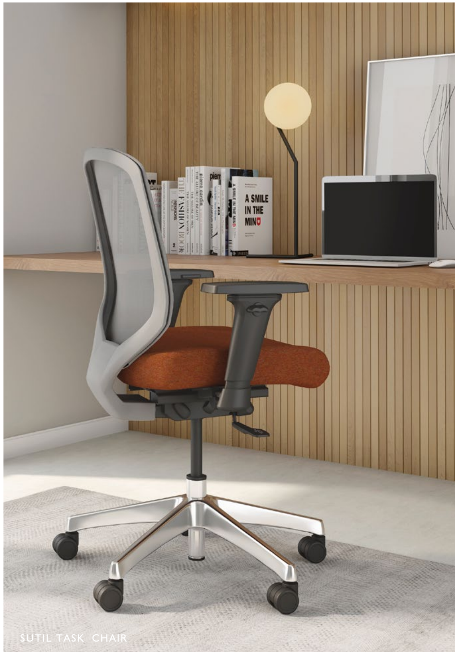
SUTIL TASK CHAIR

We offer a range of task chairs that address proper sitting. With options such as lumbar support, adjustable seat depth, back tilt, armrest height and depth adjustment and more, we can help you find the ideal task chair. We also offers ergonomic task chairs at various price points, ensuring you stay within your budget.