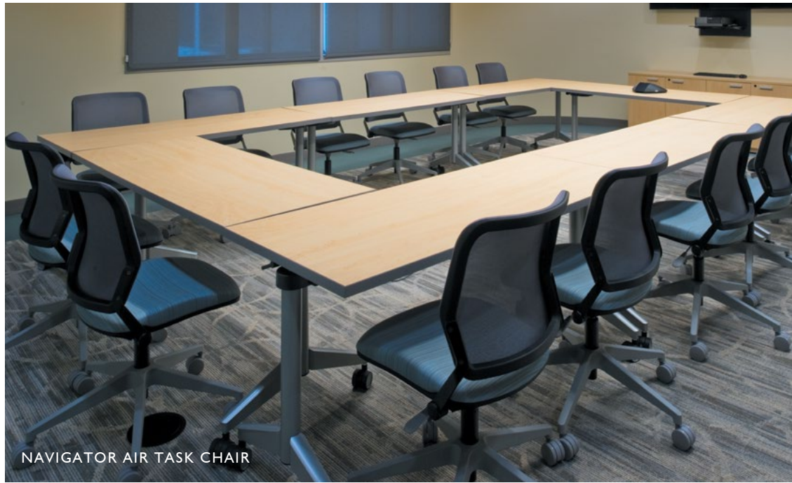
NAVIGATOR AIR TASK CHAIR

Conference seating features ease of use, simple comfort and upscale aesthetics.