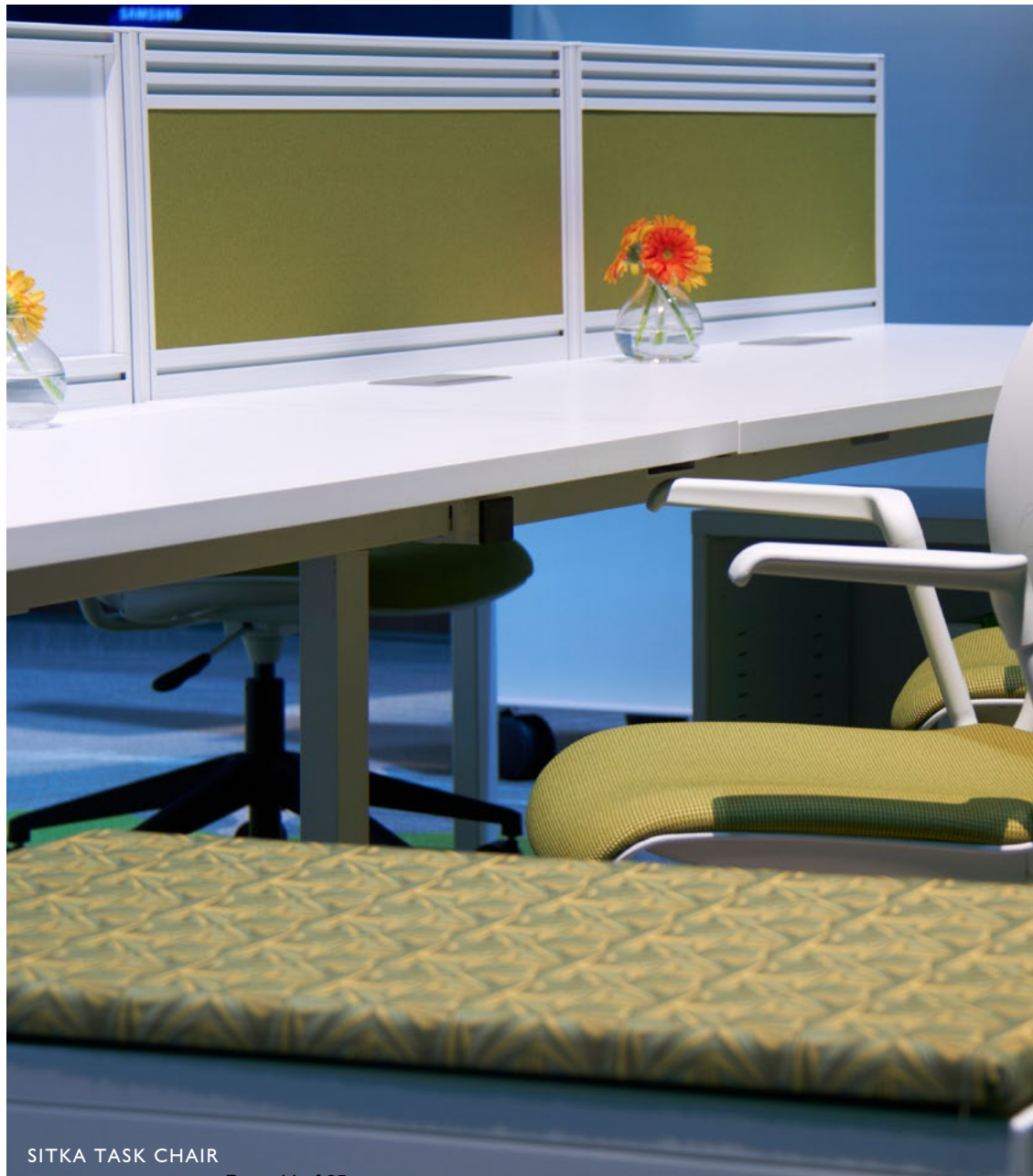
SITKA TASK CHAIR