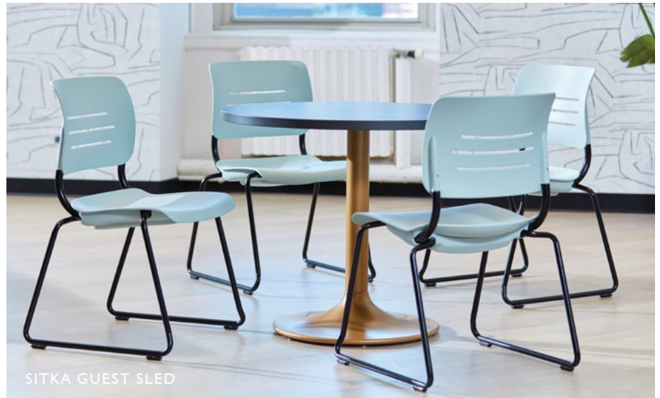
SITKA GUEST SLED

Sled base chairs slide easily on carpets. Frames are available in a wide selection of powdercoat finishes or chrome for limitless design options.