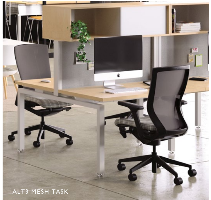
ALT3 MESH TASK

FRONT COVER PHOTOS TOP: ALT3 MESH TASK BOTTOM LEFT: RIGGER4 BOTTOM MIDDLE: OCCUPY TASK BOTTOM RIGHT: ATTAIN GUEST