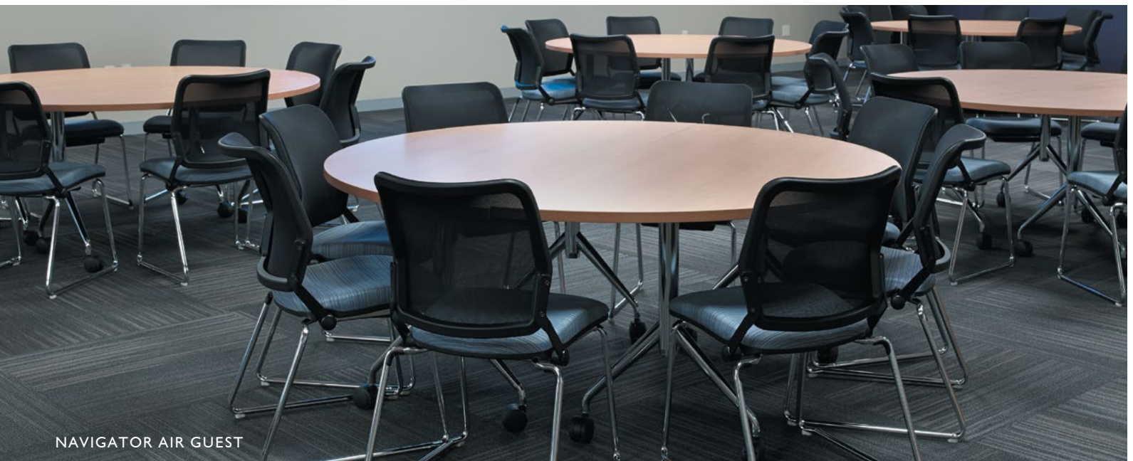
NAVIGATOR AIR GUEST