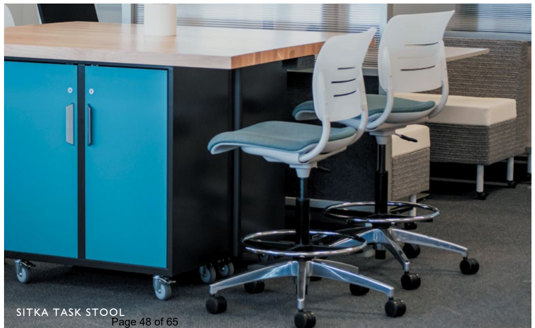
SITKA TASK STOOL Page 48 of 65