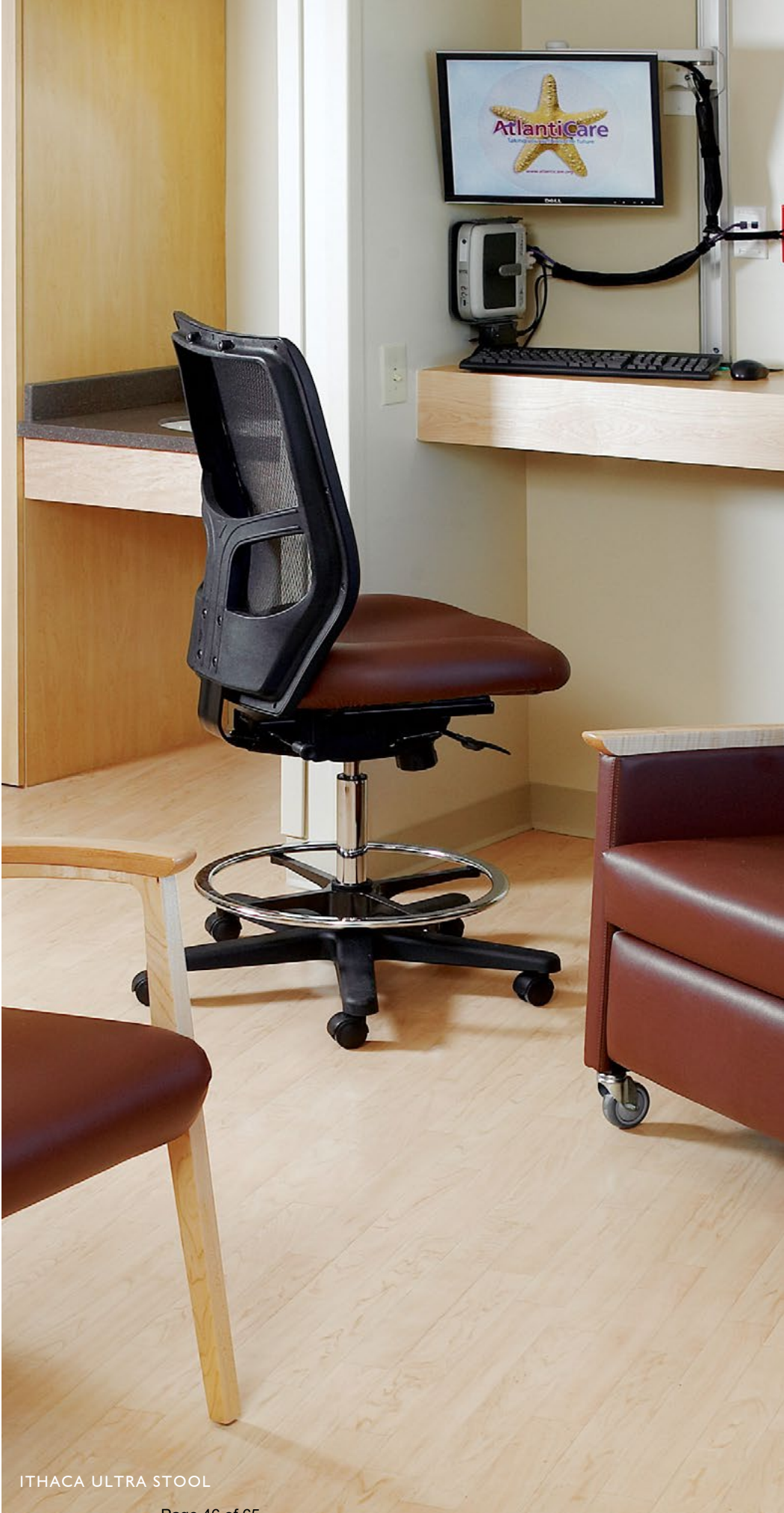
ITHACA ULTRA STOOL

For essential comfort that adjusts to the individual, advanced function task stools are ideal for maker spaces, medical, science or research labs. They provide durable, stylish seating anywhere stool height task seating is preferred.