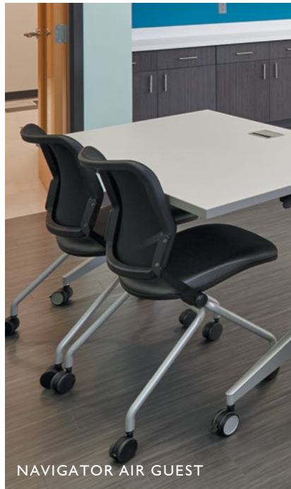
NAVIGATOR AIR GUEST

We offer a selection of styles and price ranges so that everyone can get the mobile advantage.